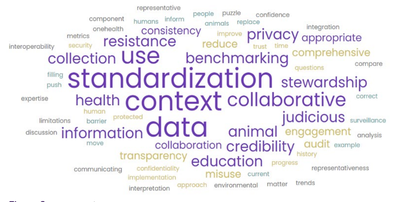
Figure 2: Summary of key words that were shared during the in-depth roundtable discussion

A full list of stakeholder organization names is included in Appendix II. The agenda for the roundtable meeting is included in Appendix I.